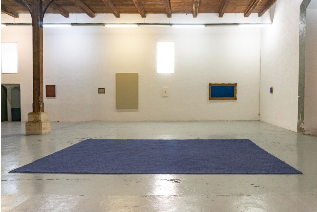
Group exhibition L.A.C. Lieu d'Art Contemporain, Sigean (FR) July 6 - September 22, 2019