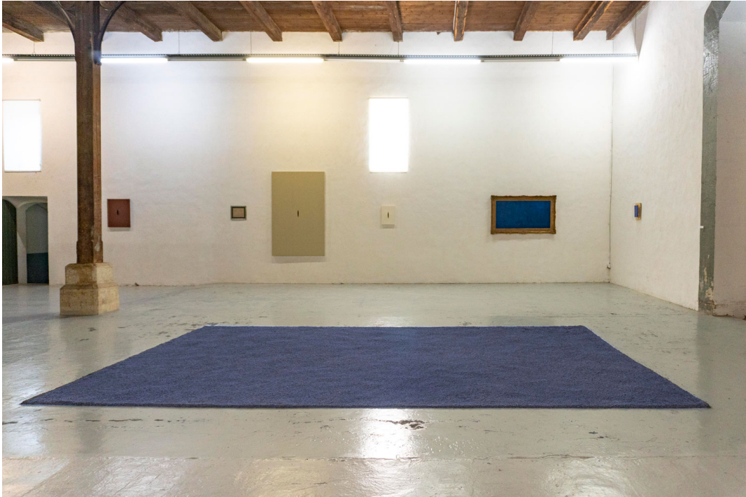
Group exhibition L.A.C. Lieu d'Art Contemporain, Sigean (FR) July 6 - September 22, 2019